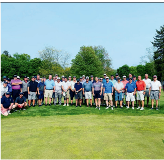
Wednesday Night League