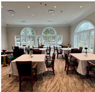
Lakeview Gallery Room